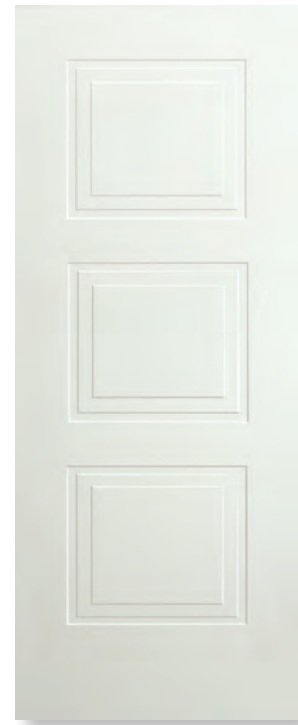
bergerac 3 panel