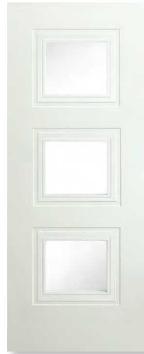
bergerac 3 lite clear glass