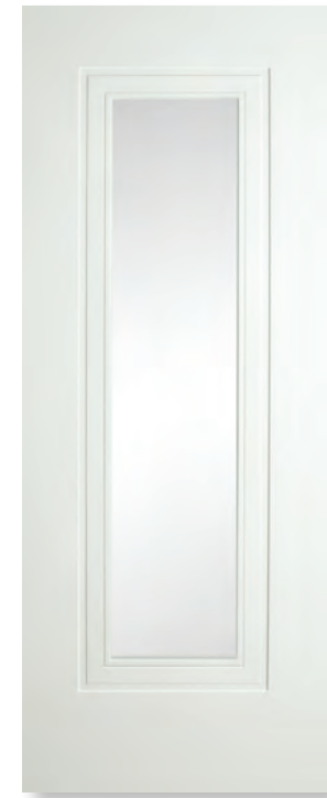
versailles 1 lite clear glass