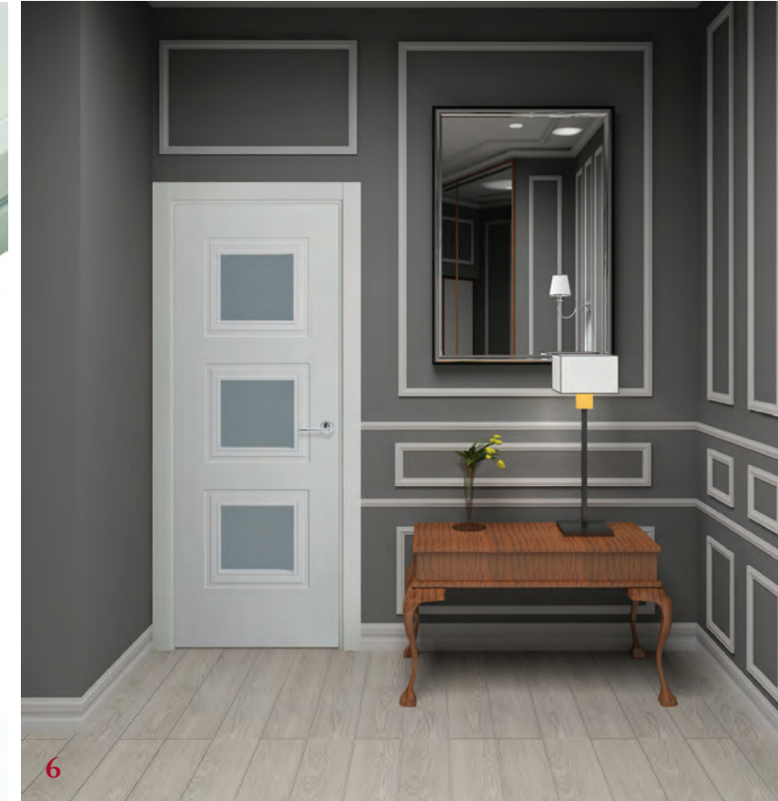
1. Versailles 1 panel; 2. Bergerac 3 panel; 3. Bergerac 3 lite (clear glass); 4. Versailles 1 lite (opal laminate glass); 5. Versailles 1 lite clear glass (moulding detail); 6. Bergerac 3 lite (opal laminate glass).