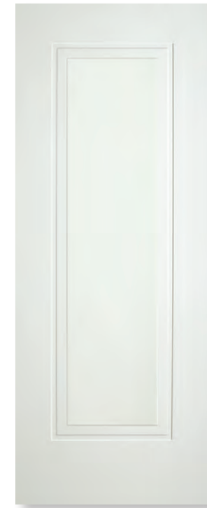
versailles 1 panel