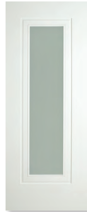
versailles 1 lite opal laminate glass