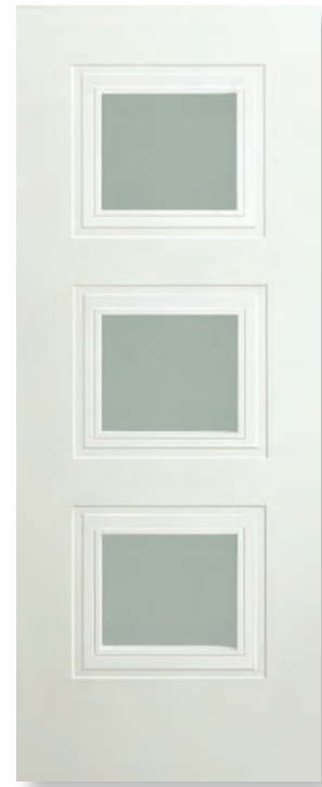
bergerac 3 lite opal laminate glass