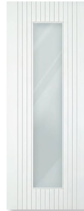
colosseum 1 lite clear glass