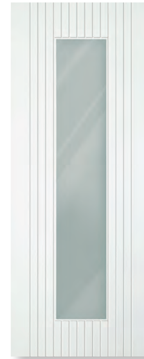
colosseum 1 lite opal laminate glass