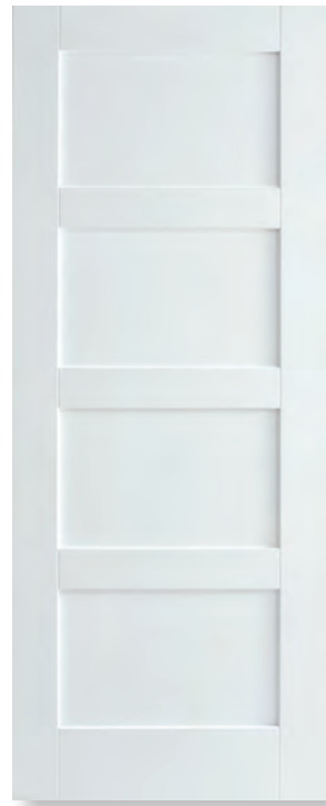
shaker 4 panel primed