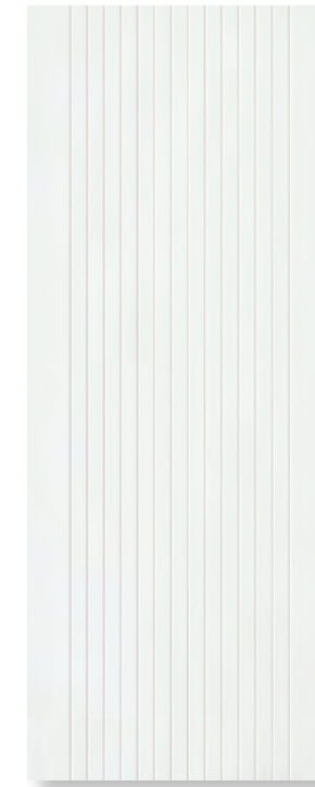
colosseum 1 panel