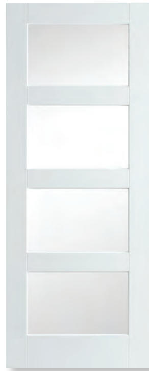
shaker 4 lite primed clear glass