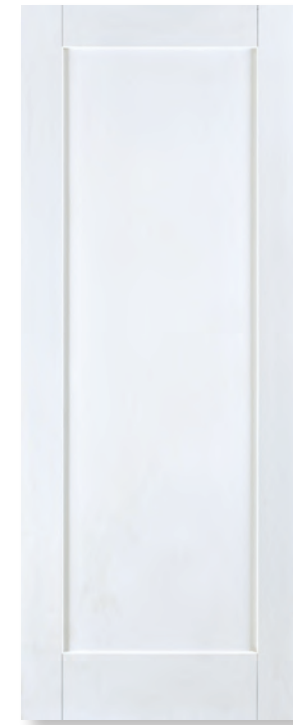
shaker 1 panel primed available as fd30