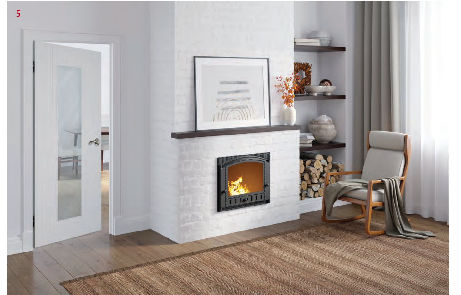
1. Torea 4 lite primed clear glass (groove detail); 2. Shaker 1 panel primed (available as fd30); 3. Shaker 4 panel primed; 4. Nema primed; 5. Colosseum 1 lite (clear glass). NEW.