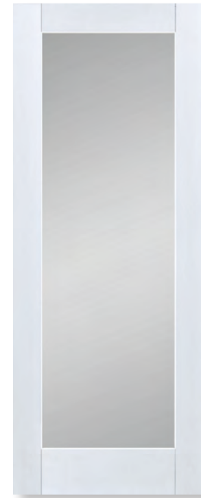
shaker 1 lite primed frosted glass*