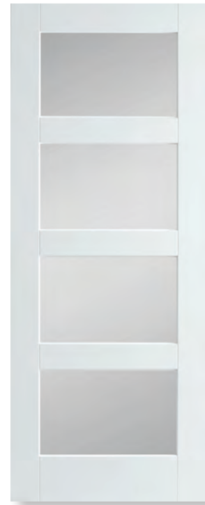
shaker 4 lite primed frosted glass