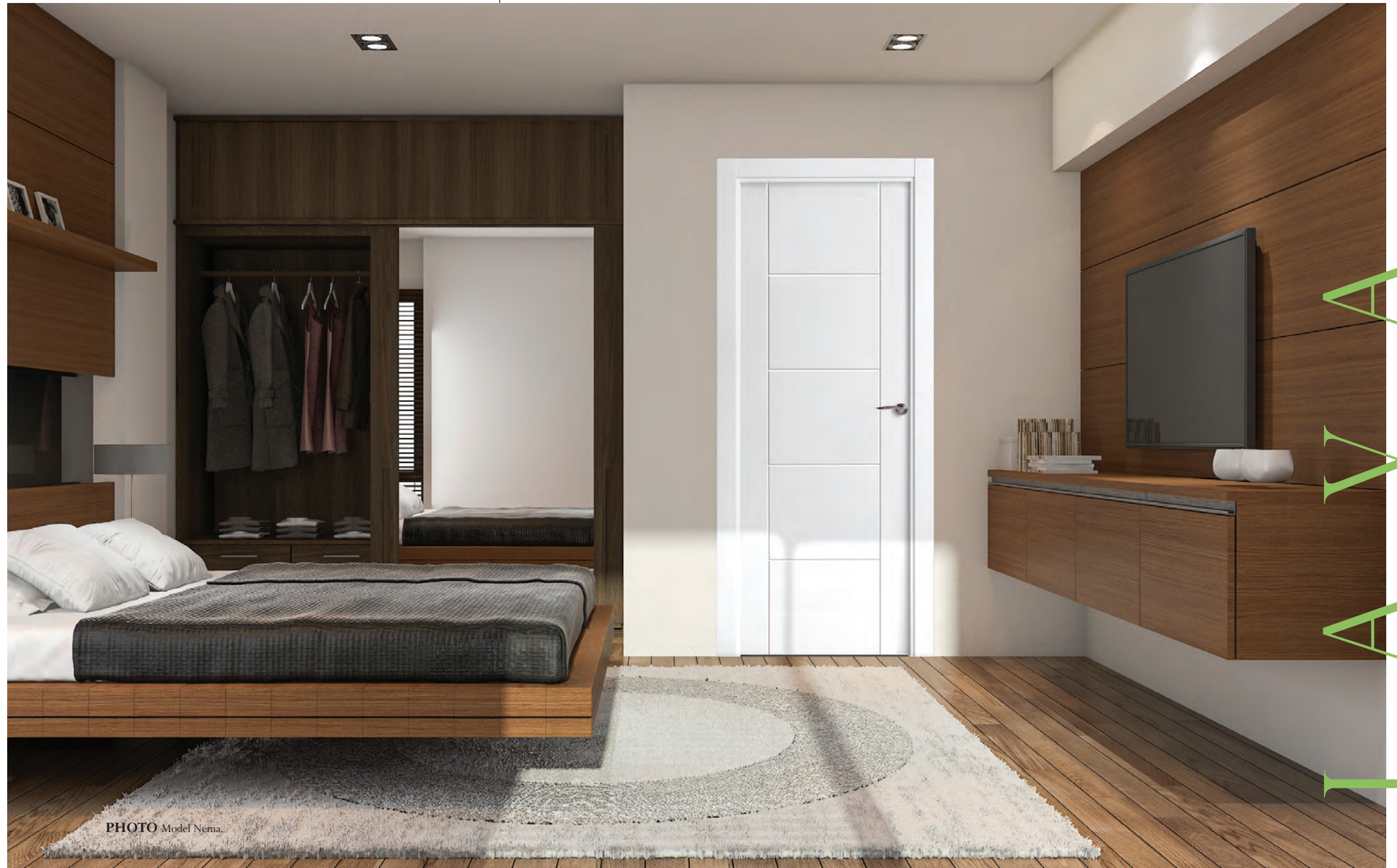
PHOTO Model Nema.

Torea, Nema and Bora models receive three coats - one base coat and two top coats.