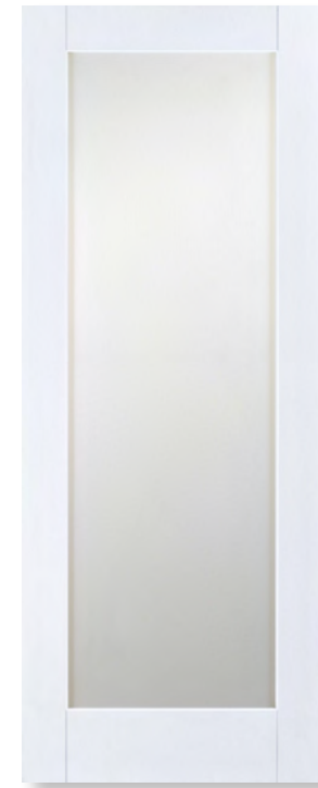
shaker 1 lite primed clear glass