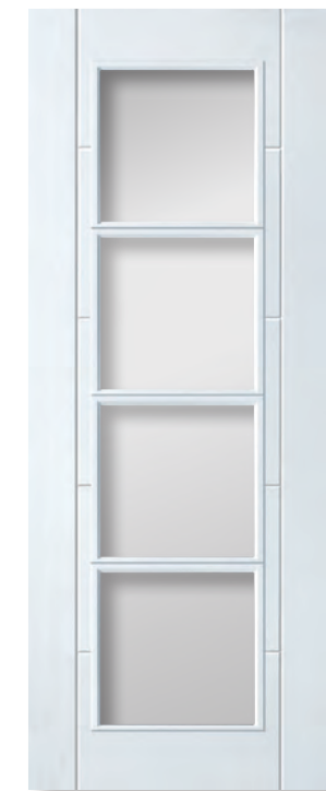
torea 4 lite primed clear glass