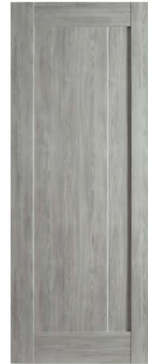
harbour laminate mist grey