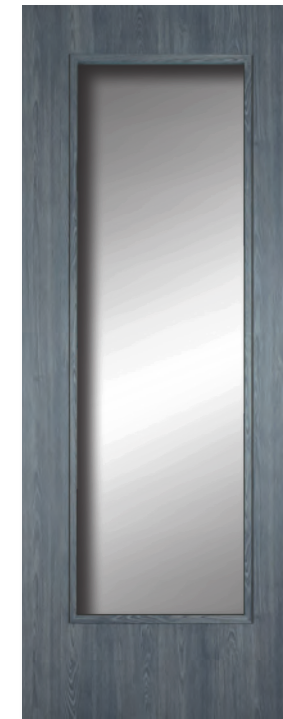
midnight grey 1 lite clear glass