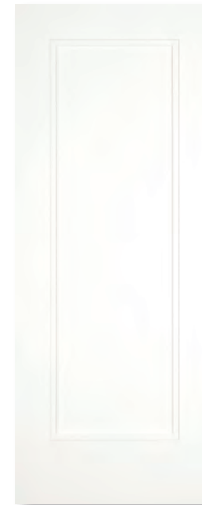
winter white 1 panel