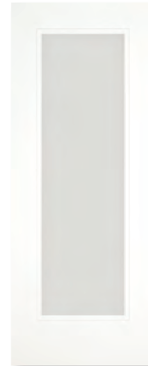
winter white 1 lite obscure glass