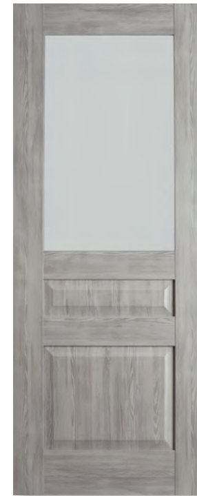
haven laminate mist grey obscure glass