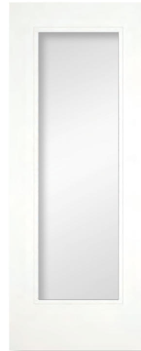
winter white 1 lite clear glass