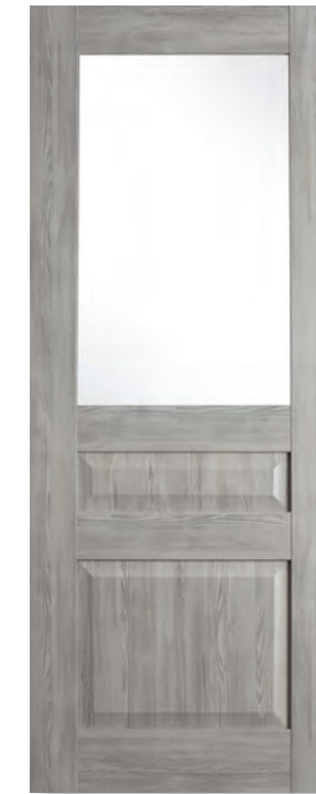
haven laminate mist grey clear glass