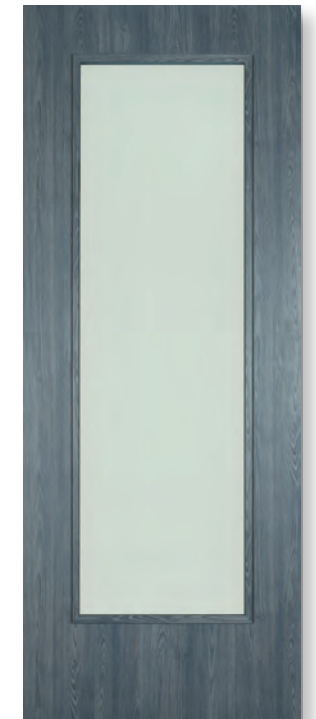
midnight grey 1 lite obscure glass