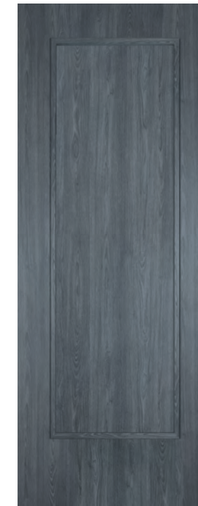
midnight grey 1 panel