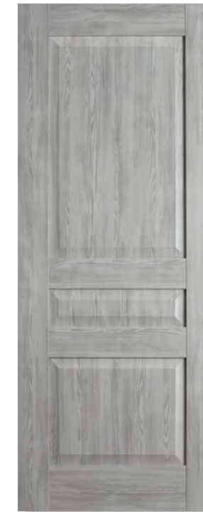
haven laminate mist grey 3 panel