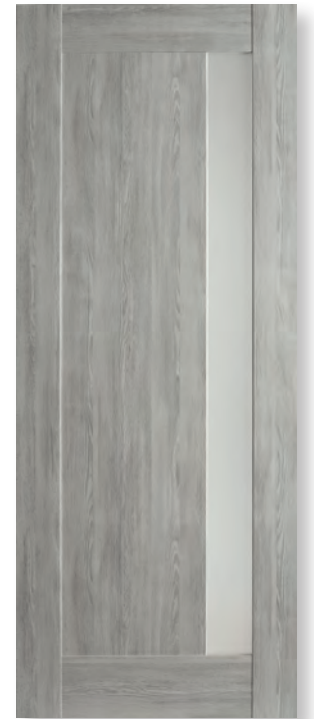
harbour laminate mist grey obscure glass