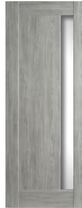
harbour laminate mist grey clear glass