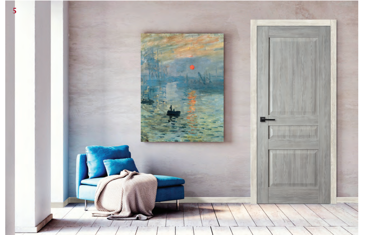
1. Winter white 1 lite ( obscure glass ); 2. Harbour laminate mist grey; 3. Midnight grey 1 lite ( obscure glass ); 4. Haven laminate mist grey ( obscure glass ); 5. Haven laminate mist grey.