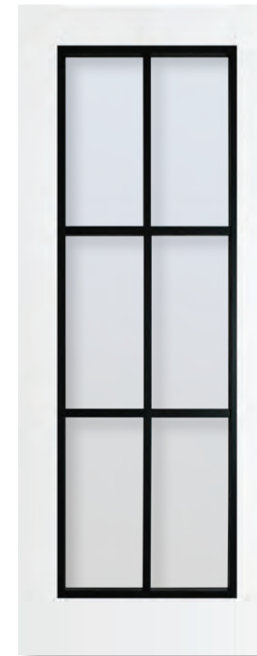
black on white 6 lite clear glass