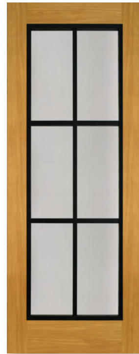
black on oak 6 lite opal laminate glass