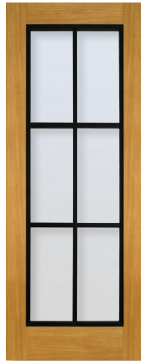
black on oak 6 lite clear glass