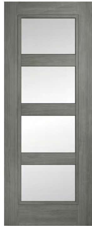
grey 4 lite clear glass