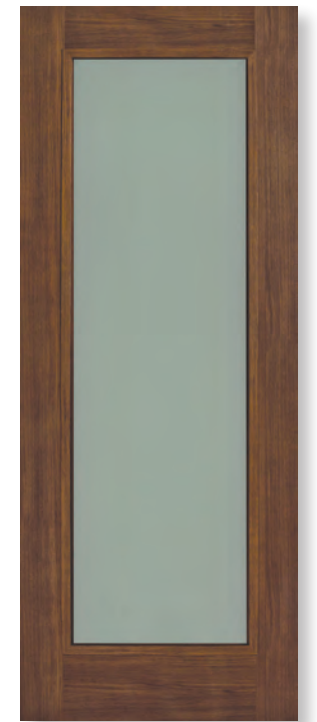
walnut 1 lite opal laminate glass