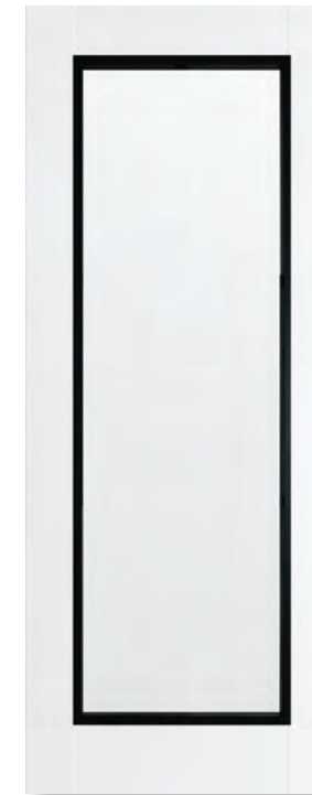
black on white 1 panel