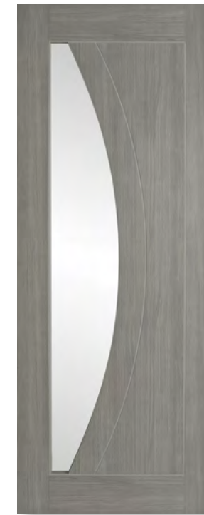
eclipse clear glass