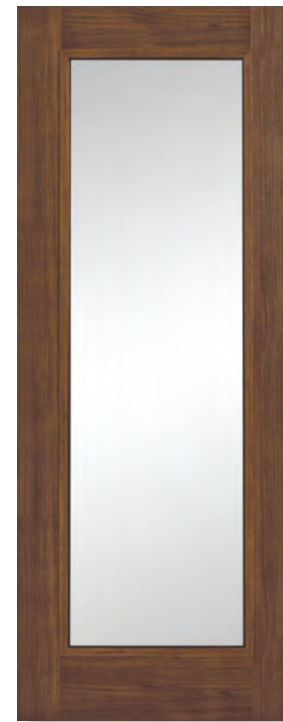
walnut 1 lite clear glass