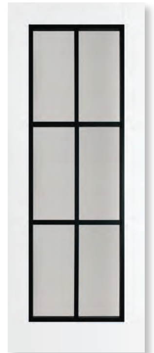
black on white 6 lite opal laminate glass