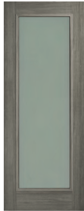
grey 1 lite opal laminate glass