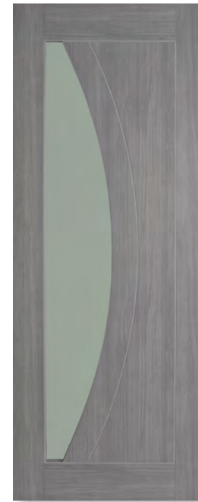
eclipse opal laminate glass