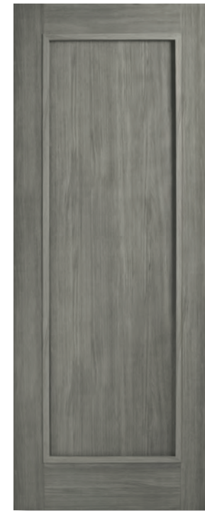
grey 1 panel