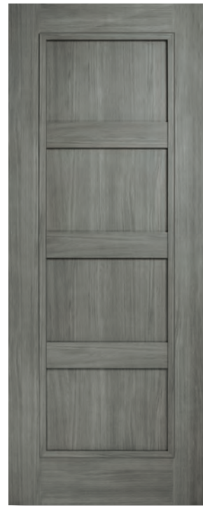
grey 4 panel