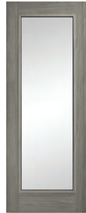
grey 1 lite clear glass