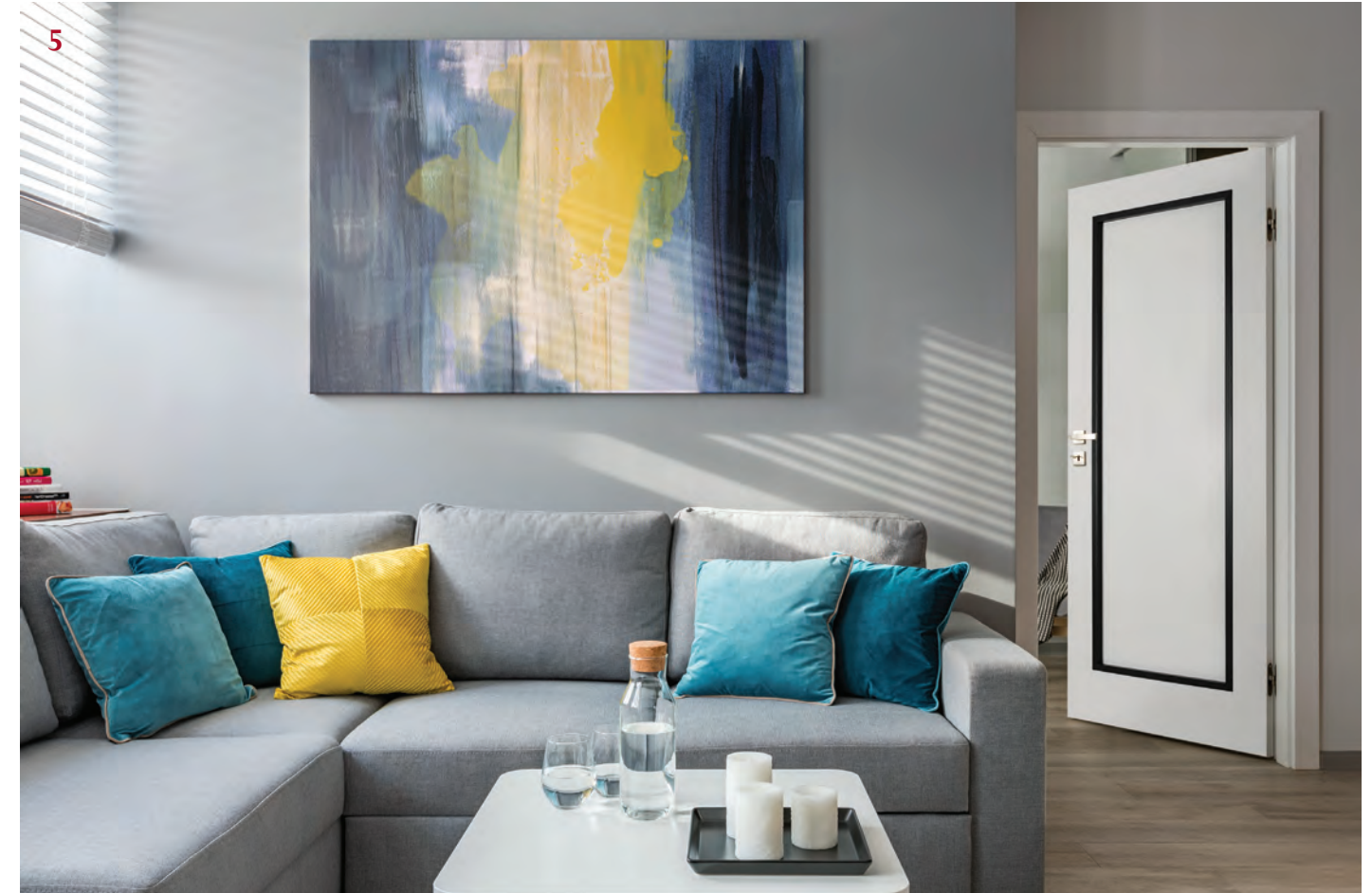
1. Black on oak clear glass (bead detail). NEW; 2. Grey 4 panel; 3. Black on oak (opal laminate glass). NEW; 4. Grey 4 panel (flat panel detail); 5. Black on white 1 panel. NEW.