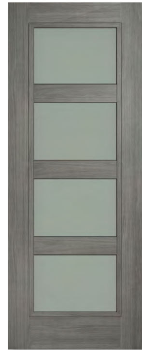
grey 4 lite opal laminate glass